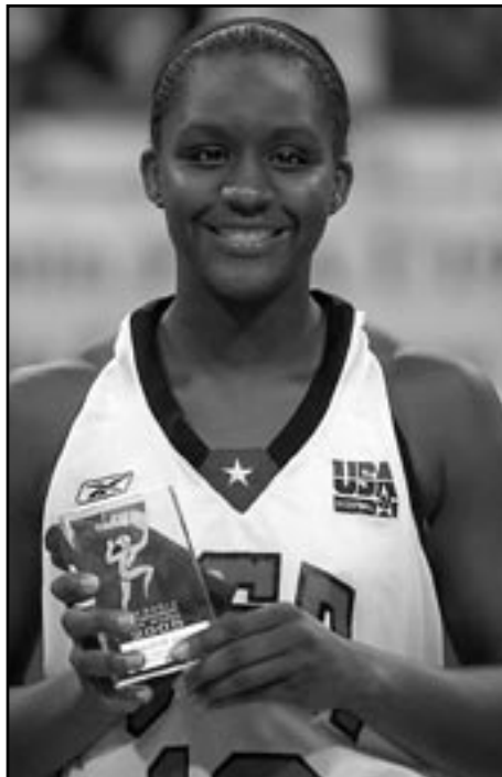
Crystal Langhorne was named the MVP at the 2005 FIBA U19 World Championship in Tunis, Tunisia.