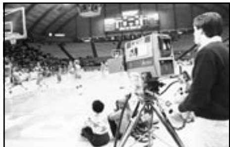
The first-ever televised women's basketball game.