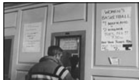
The No. 1-ranked Terps hosted No. 2 Virginia before a sellout crowd in 1992.