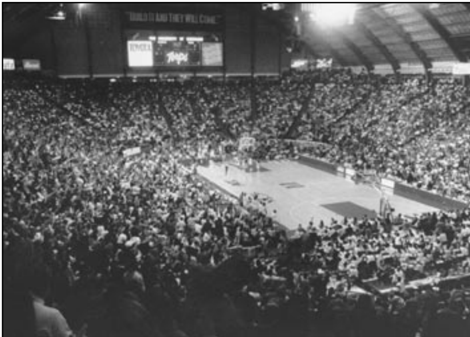
No. 1 ranked Maryland drew an ACC record 14,500 to its game against No. 2 Virginia on Feb. 12, 1992.