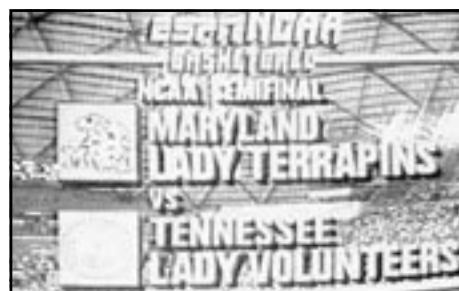
UM's Final Four game with Tennessee was on ESPN.